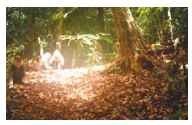
Fig.5. Camera trap photo shows three juvenile red-shanked douc langurs playing on the ground.

Vietnamese Journal of Primatology (2019) vol.3(1), 27-40 Primates of Ba Na - Nui Chua Nature Reserve