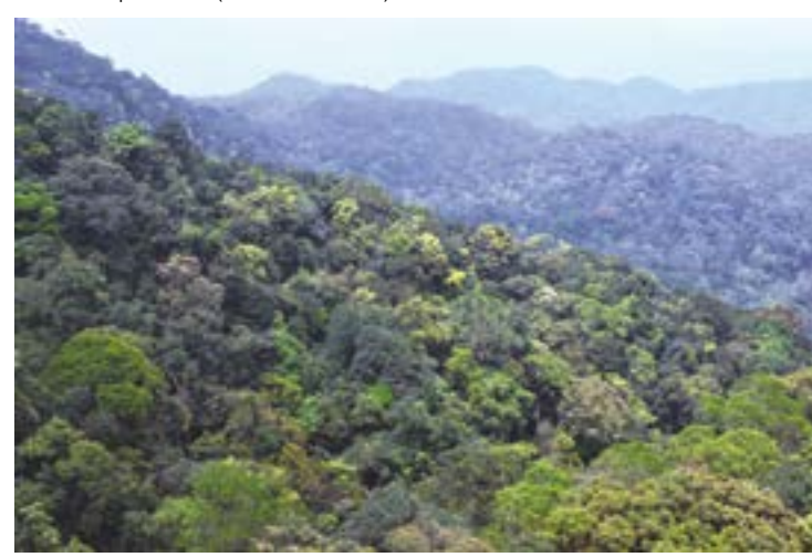
Fig.2. Lower montane evergreen forest at Ba Na-Nui Chua Nature Reserve.

The main vegetation types at BNNC are lowland evergreen forest (<1,300 m asl) and lower montane evergreen forest (>1,300 m asl) (Fig. 2). Dipterocarpaceae dominate the lowland evergreen forest, but are absent in the lower montane evergreen forest, which is characterized by Fagaceae, Lauraceae and Podocarpaceae (Hill et al. 1996).