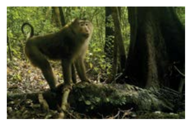
Fig.7. Camera trap shot a northern-pig-tailed macacque (Macaca leonina).