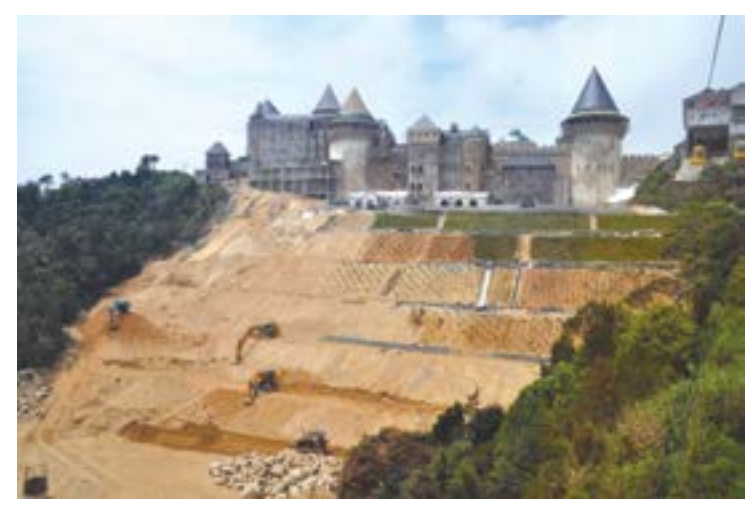
Fig.3. Mountain top in Ba Na-Nui Chua Nature Reserve in 2012 during the conversion in a Mega-Tourist Amusement Park.

Selective logging occurred in the Annamite Mountains in the early 1900's, and the habitat suffered further devastation during the Vietnam War. Consequently the forests at all elevations in BNNC have been impacted. Previous clearings support only secondary growth, which varies in vegetation structure and composition depending on the time that has elapsed since the disturbance. The original parcel of BNNC has been opened for tourism in 2002 and in the past 15 years habitat disturbance has increased dramatically, especially on Ba Na Mountain where a major tourism development transformed the forest area into a resort and amusement park, which included the installation of a 5.8 km long cable car system. The area is a very popular tourist destination and averaging 5000 visitors daily, the number of visitors to Ba Na Mountain surpassed 1.5 million in 2015 (Data: Ba Na Cable Car Co., Ltd) (Fig. 3).