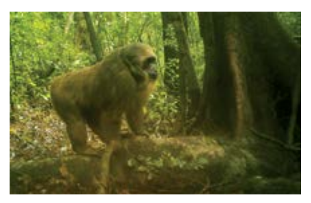
Fig.6. Camera trap shot a stump-tailed macacque (Macaca arctoides).

Interestingly only M. leonina treated the novel object "camera trap" as a potential threat e.g. by showing aggressive facial expressions and body posture. This species might be more protective and might defend its home range from perceived intruders.